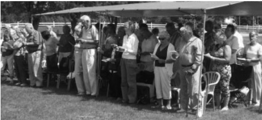
Maitland Community Worship Service.